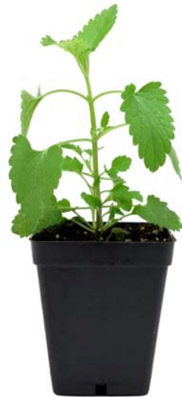
CATNIP/CATMINT NEPETA CATARIA