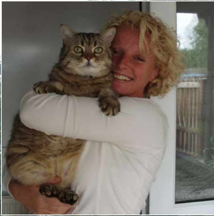
HARPENDEN CAT HOTEL