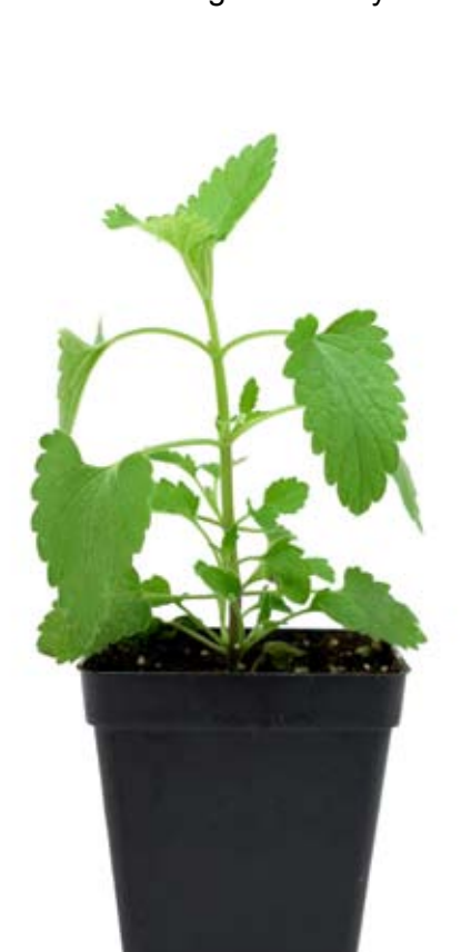
CATNIP/CATMINT NEPETA CATARIA

DO NOT use grass from your lawn, it may well have contaminants, fertiliser or pesticide residues